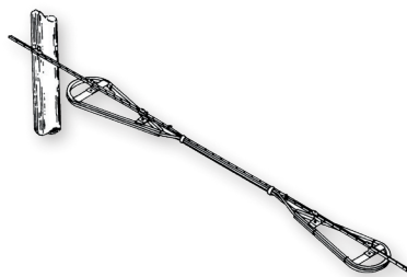
Reserve Cable Storage